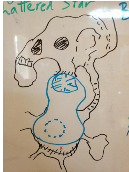
Amatatsu Maemi's Throne Room (Or, the Donkey Skull)

Ameiko and Yoshihiro decide to bluff their way through it. “Greetings, revered ancestor. An Amatatsu seeks your blessing to become Empress!” Gobo creates a moon bridge up to the balcony and the group calmly ascends.