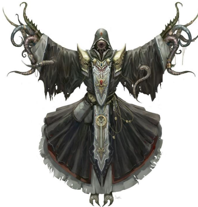
The Gylou Devil, or Handmaiden of Hell

The spirit of Amatatsu Onoko frees several characters of the unfortunate spirits that had been possessing them, most notably Jacob’s Swine Shogun spirit that makes him eat foul things when he’s bored. She refrains from freeing Harwynian of his possessor – he seems to have developed a comfortable relationship with his inner companion.